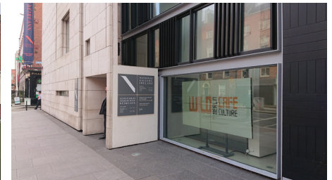
Clare Street Entrance

You can find out more about the history and architecture of the Gallery here: https://www.nationalgallery.ie/history