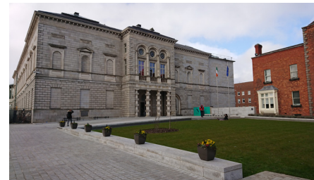
Merrion Square Entrance

There are two entrances to the Gallery. How may your first impressions differ depending on which entrance you use?